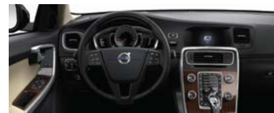
Urbane Wood (849) Inscription