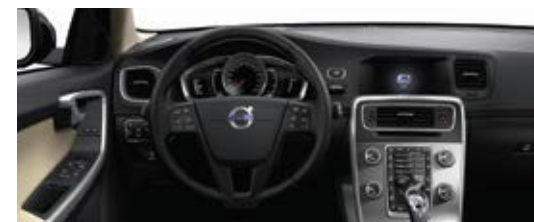
Milled Aluminum (800120) Momentum