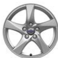
Hera 7x16x55 215/55 R16V