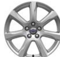
Pallene 7x17x50 215/50R17W